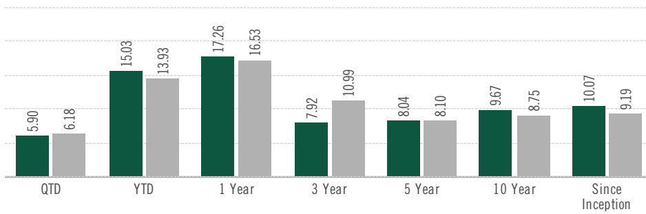
AVERAGE ANNUAL TOTAL RETURNS (%) as of 06/30/2023 ■ Fund Class I ■ Index

Performance data quoted represents past performance. Past performance does not guarantee future results. Investment return and principal value will fluctuate so that shares, when redeemed, may be worth more or less than their original cost. Current performance may be lower or higher than the performance data quoted. Please visit virtus.com for performance data current to the most recent month end. This share class has no sales charges and is not available to all investors. Other share classes have sales charges. See virtus.com for details.